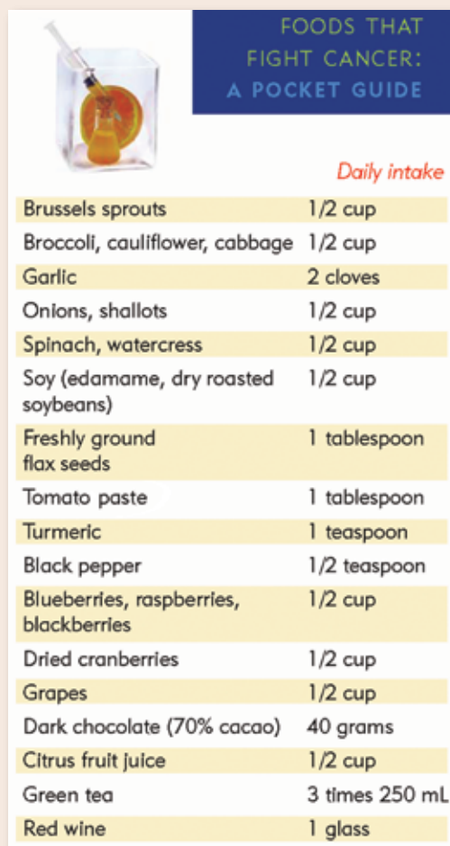
Figure 2. Including foods with chemopreventive properties in a daily diet

A large number of epidemiologic, animal, and laboratory studies indicate that abundant consumption of food of plant origin reduces the risk of several types of cancer. The chemopreventive effect is related to the high content in these foods of phytochemicals with potent anticancer and anti-inflammatory properties. These properties block precancerous cells from developing into malignant cells by interfering directly with tumour cells and by preventing generation of an inflammatory microenvironment that would sustain the progression of the tumours. In many cases, these anticancer phytochemicals interfere